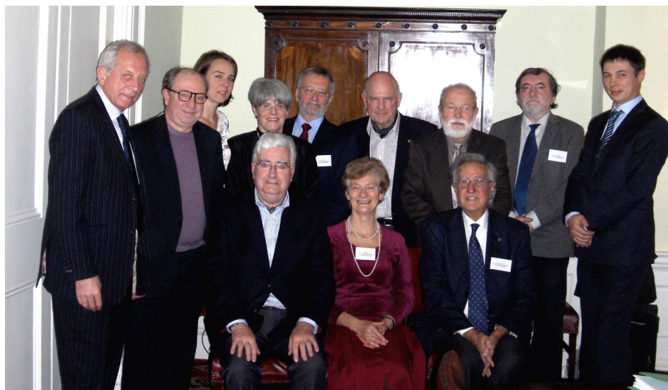
ALLEA Working Group on Science Education, Dublin, November 2013